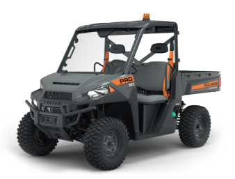
PRO XD DIESEL